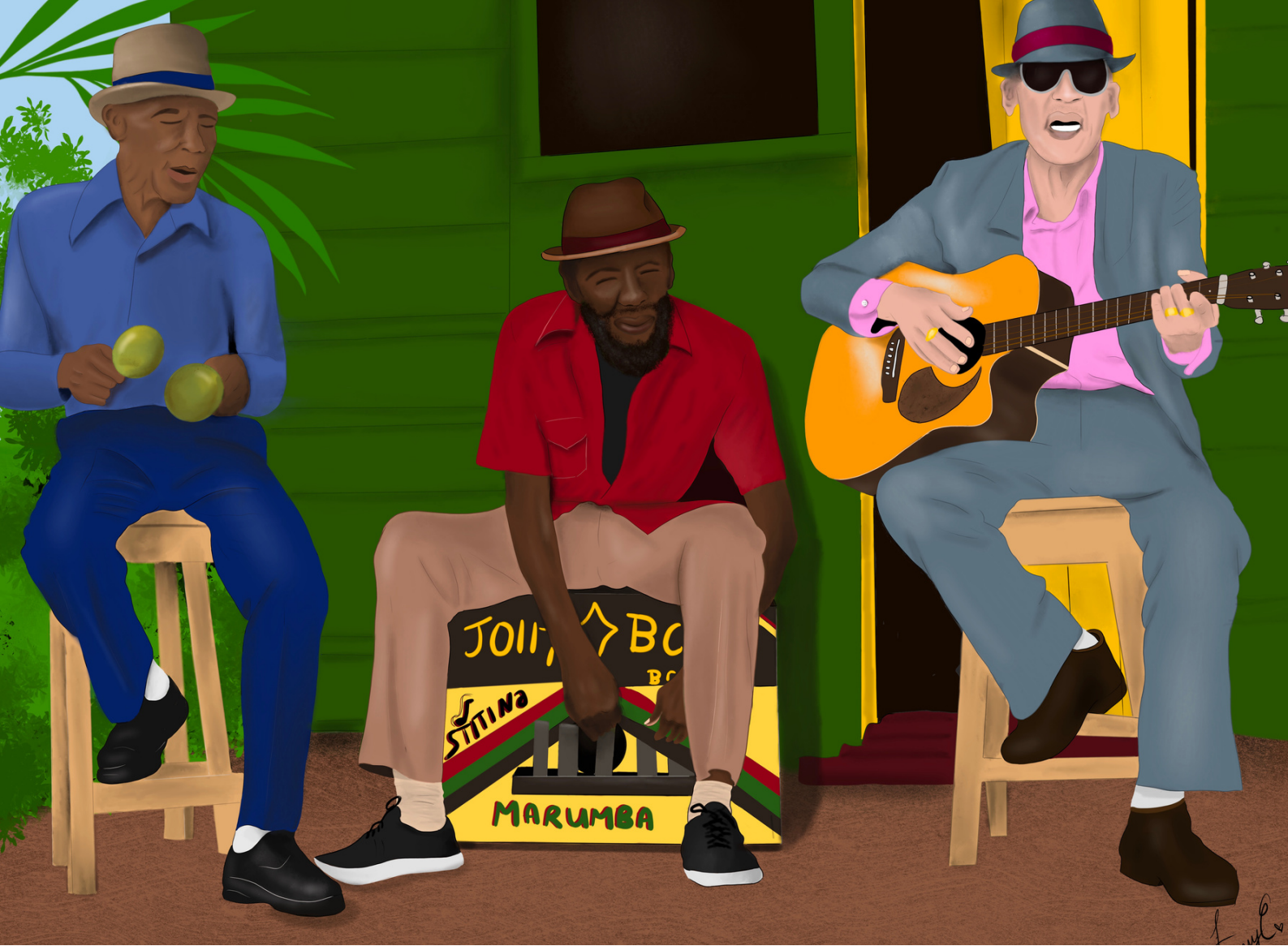
ILLUSTRATION OF THE MONTH:

My favorite illustration this month is one of my more recent illustrations titled "We Jammin'"