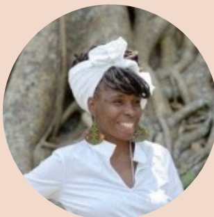
INNER CHILD HEALING @movements_for_change