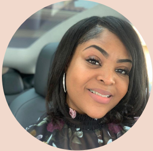
PRAYER WORKSHOP @the_noble_women