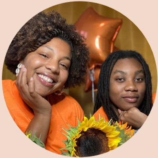
CREATIVE WORKSHOP @honeysoul @fannyariel