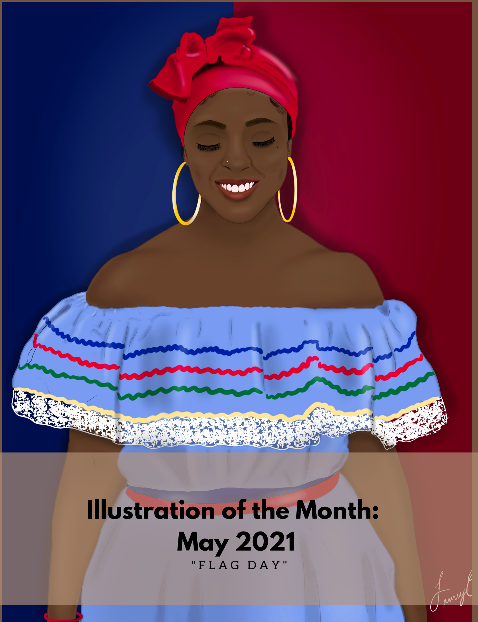
Illustration of the Month: May 2021 "FLAG DAY"