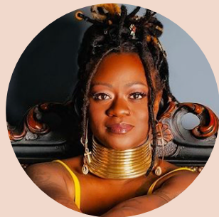
MORNING AFFIRMATIONS @_browngirlsheal